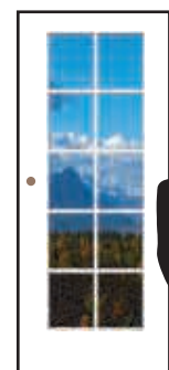
7. Remove tape guidelines