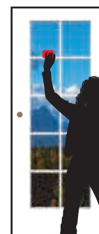
6. Use scraper to remove remaining bubbles